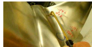
Fingertip probe can be used as well